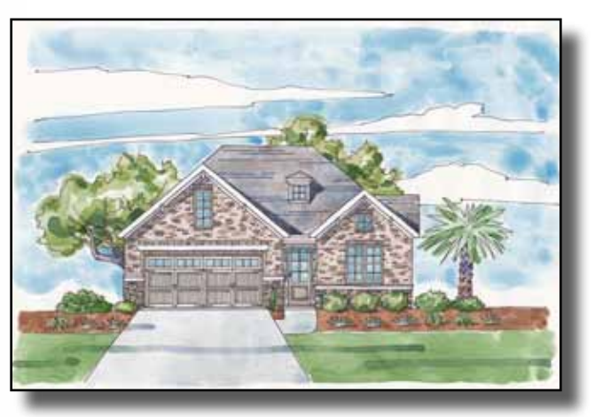
Alternate Elevation w/o Golf Cart