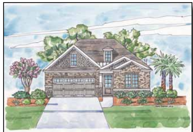
Alternate Elevation w/o Golf Cart